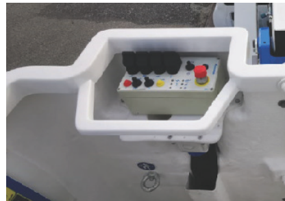
Emergency Start/Stop and control at basket