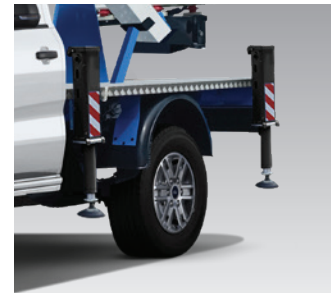
Front and rear outriggers Chassis leveling capability