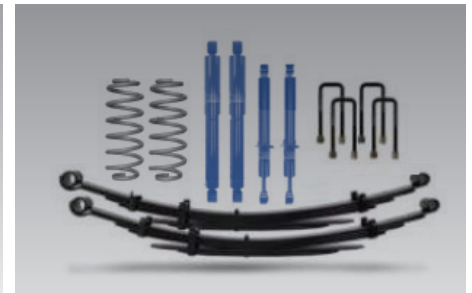
Suspension Upgrade 3.5T