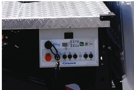
Emergency Start/Stop and control at rear tray