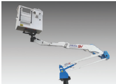
Telescopic boom with extension and swivelling realised.