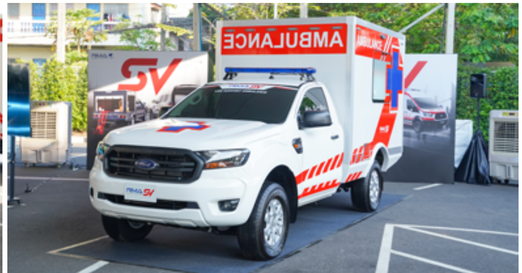
RSV vehicles on display were the Mobile Maintenance Vehicle, Ford Ranger Ambulance, Ford Ranger Aerial Platform and a Ford Ranger painted in chameleon paint by RMA Paint.